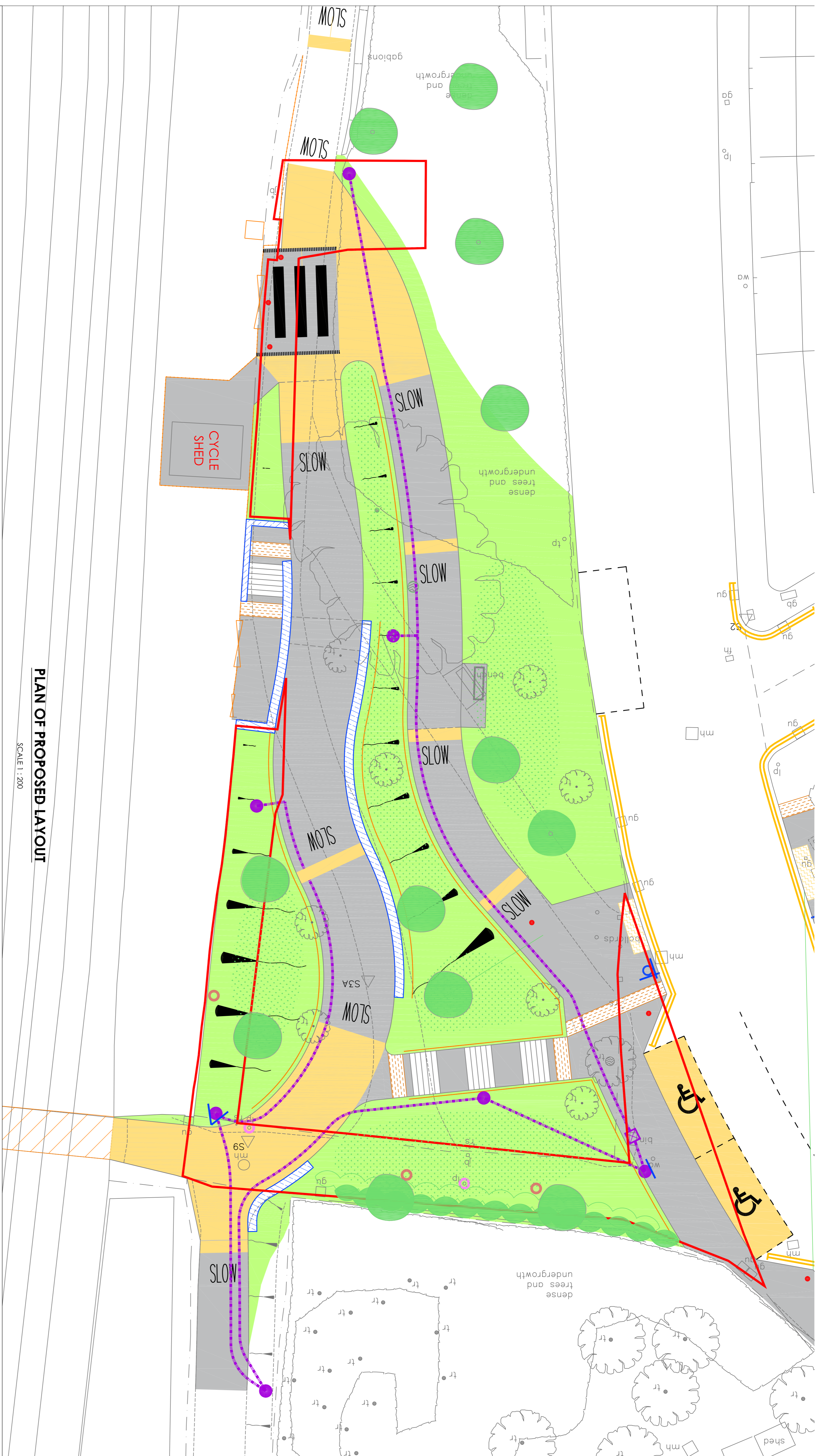
PLAN OF PROPOSED LAYOUT